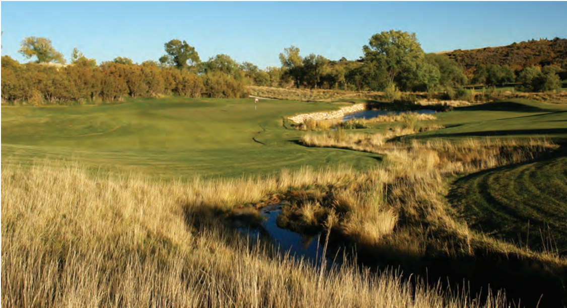
THE HIDEOUT GOLF CLUB IN UTAH - PHOTO BY BRIAN OAR.

While it sounds simple, reducing areas of managed turf—and in turn reducing water use—are often overlooked by courses when it becomes necessary to trim operating costs.